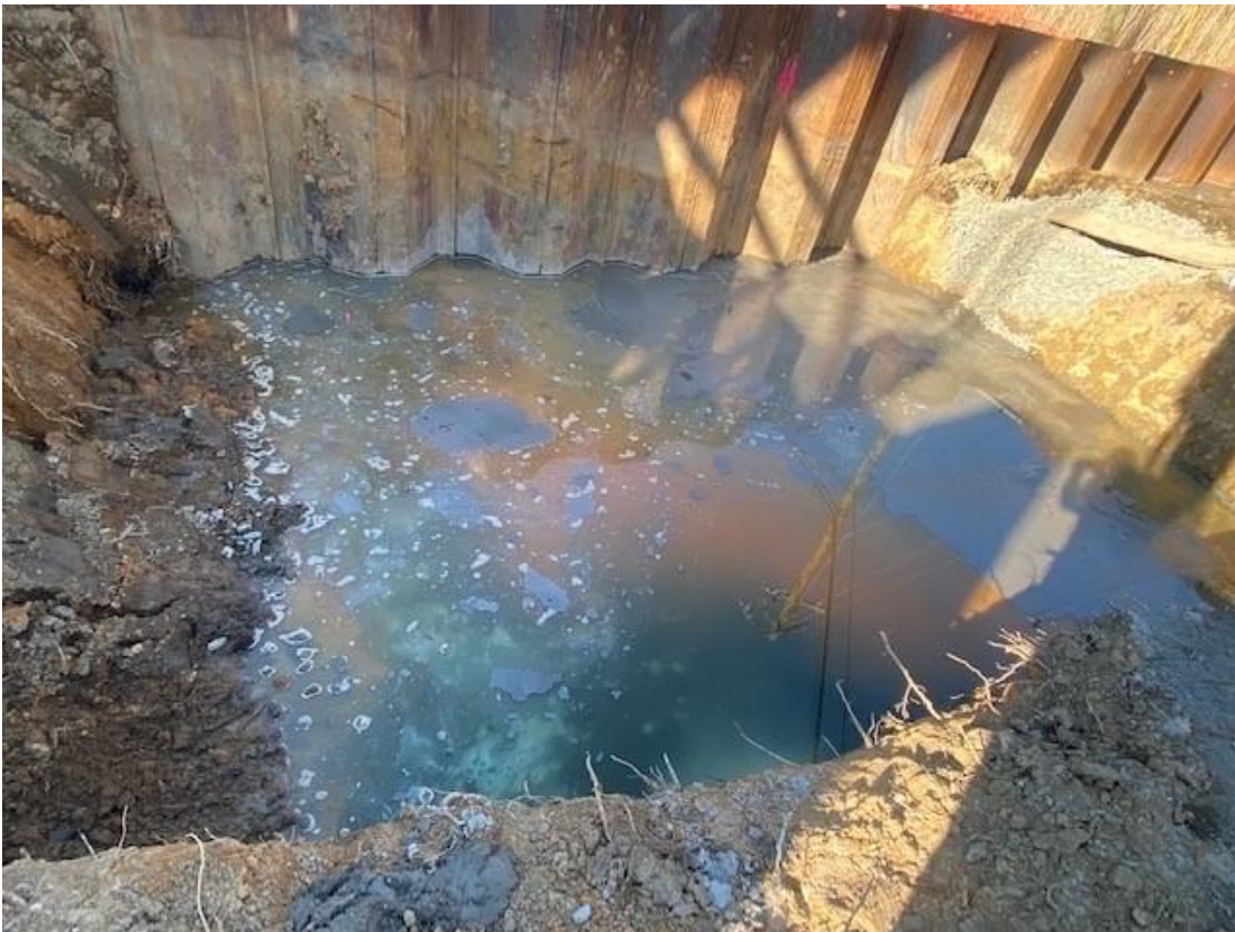
BR 159, James Street Bridge Project