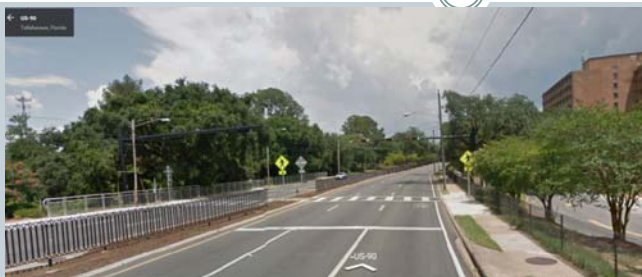
Mid-block crossing, median barrier, sidewalk with buffer