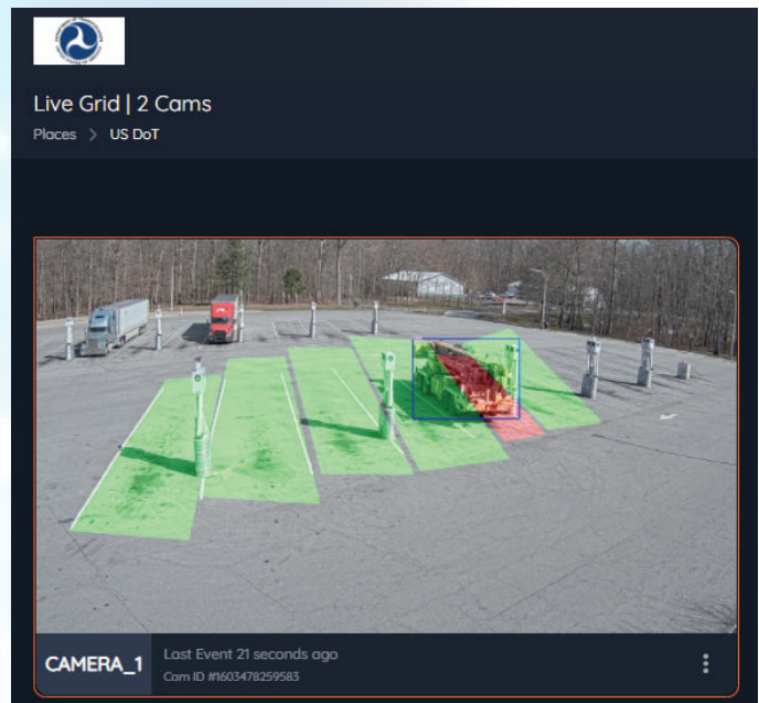
Example of how machine vision identifies occupancy and capacity of truck parking. The space highlighted in red with a truck in it reflects the system’s detection that the space is occupied.

Other transportation-related applications of machine vision technology, which could be beneficial to Delaware, include: