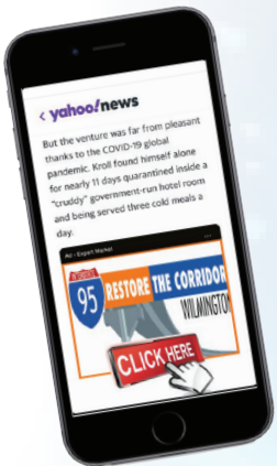
Example of the simple message that appears on the target traveler's device. From there, the user clicks to get to a landing page with additional traveler information.

Transportation agencies often need to reach a specific group of travelers to inform them about work zone restrictions and safety measures. Geo-based narrowcasting is a recently developed yet widely used technology that can serve as a powerful tool for public information and outreach to travelers.