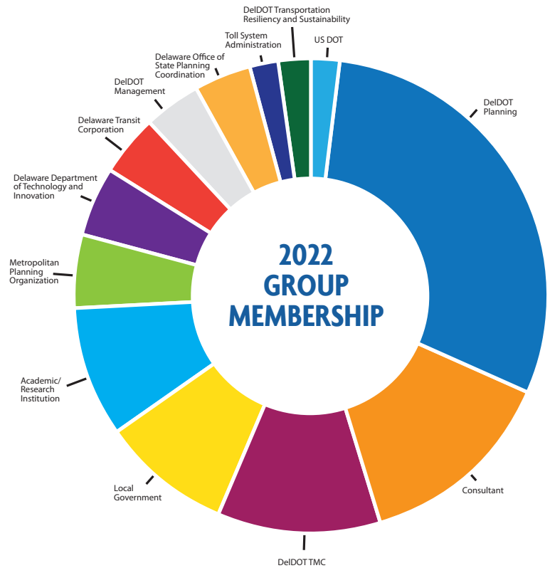
Organizational representation of Int Ops Advisory Committee members.

With over 50 members, this multi-agency collaboration organizes input into key decisions, provides guidance, and takes action to meet transportation goals throughout the state. The chart to the right shows the current organizational representation of the group.