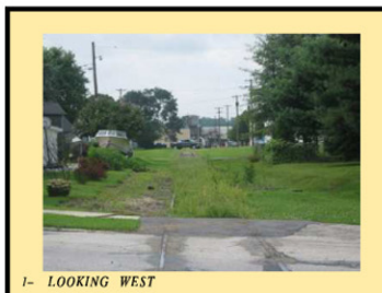
1- LOOKING WEST