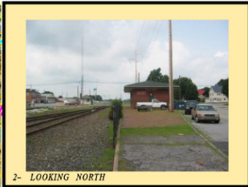
2- LOOKING NORTH