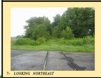
7- LOOKING NORTHEAST