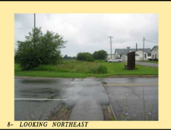
8- LOOKING NORTHEAST