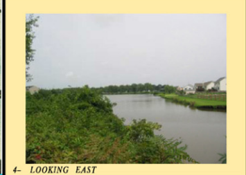
4- LOOKING EAST