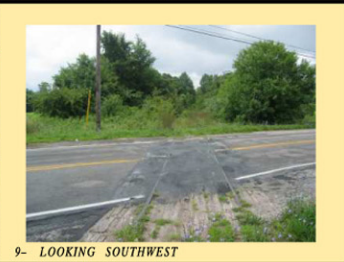
9- LOOKING SOUTHWEST