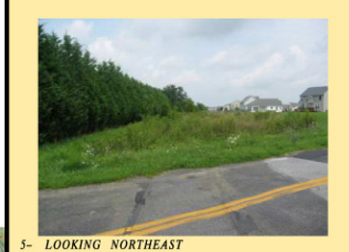
5- LOOKING NORTHEAST