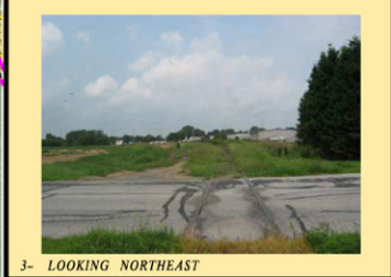
3- LOOKING NORTHEAST