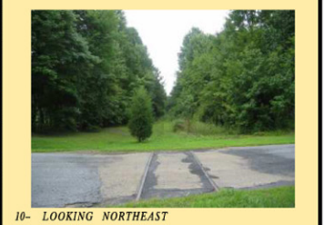
10- LOOKING NORTHEAST