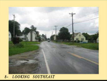
8- LOOKING SOUTHEAST