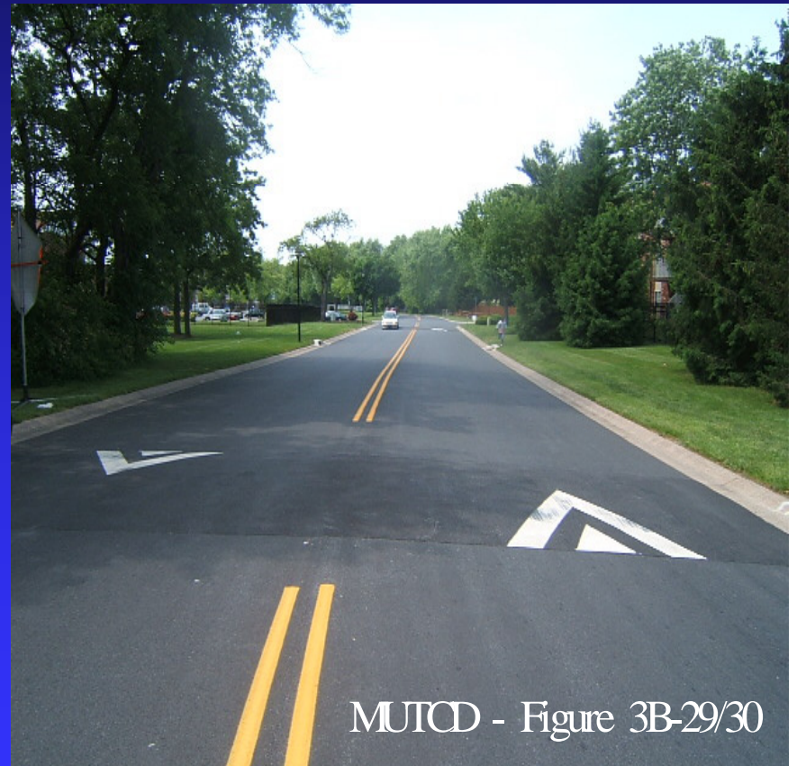
MUTCD - Figure 3B-29/30