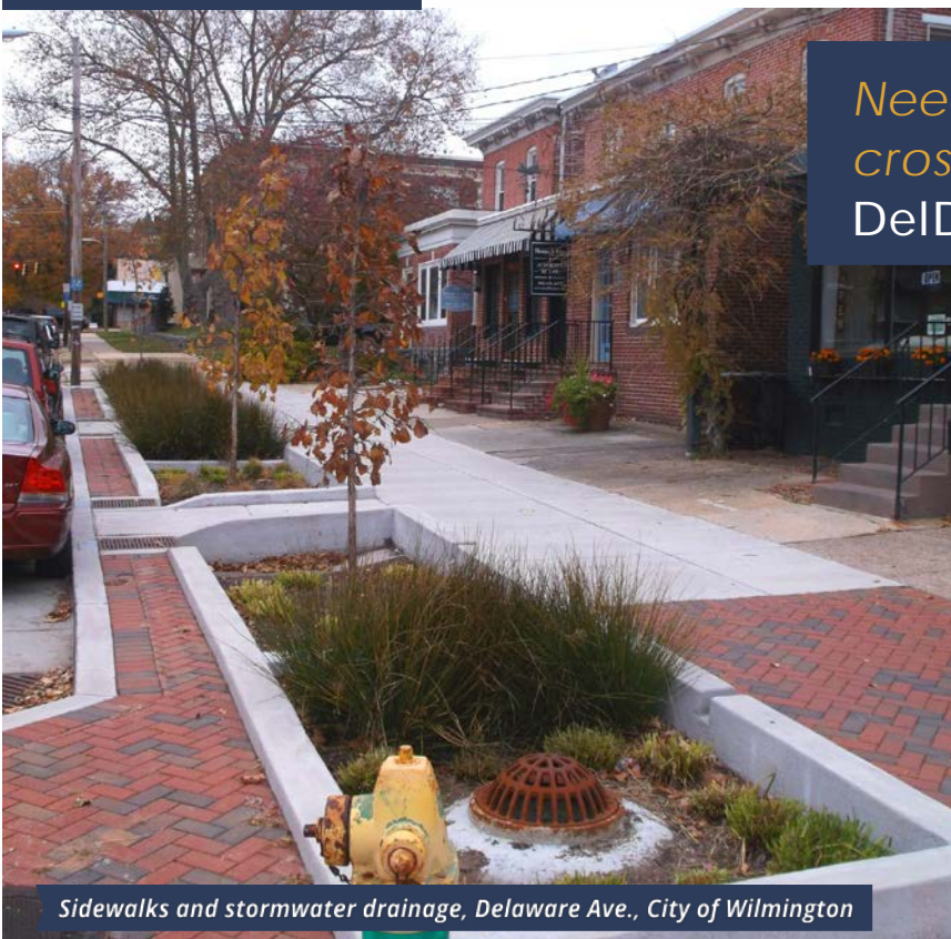
Sidewalks and stormwater drainage, Delaware Ave., City of Wilmington

Need a sidewalk, pedestrian crossing, bike lane, or pathway? DeIDOT has a solution!