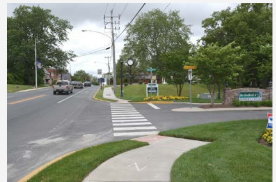
Main Street, Town of Dagsboro

ADDITIONAL INSTRUCTIONS AND APPLICATION FORM ARE FOUND HERE: