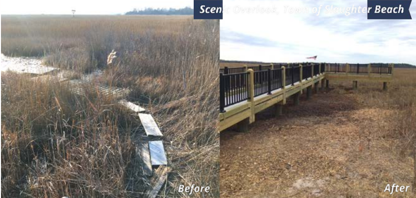
Scen Overlook, Town of Slaughter Beach

DeIDOT offers this program to provide communities throughout the state opportunities enhance and bolster themselves by implementing their long term visions and plans for safer and more accessible pedestrian and bicycle traffic through the creation of visual cues, bike lanes, wider walkways, cross walks, ADA accessibility, and more.