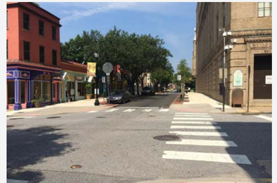
9th & Tatnall Streets, City of Wilmington

All applications within the WILMAPCO jurisdiction should be submitted through their organization and to DeDOT. All other projects outside of this submit the application directly to DeDOT.