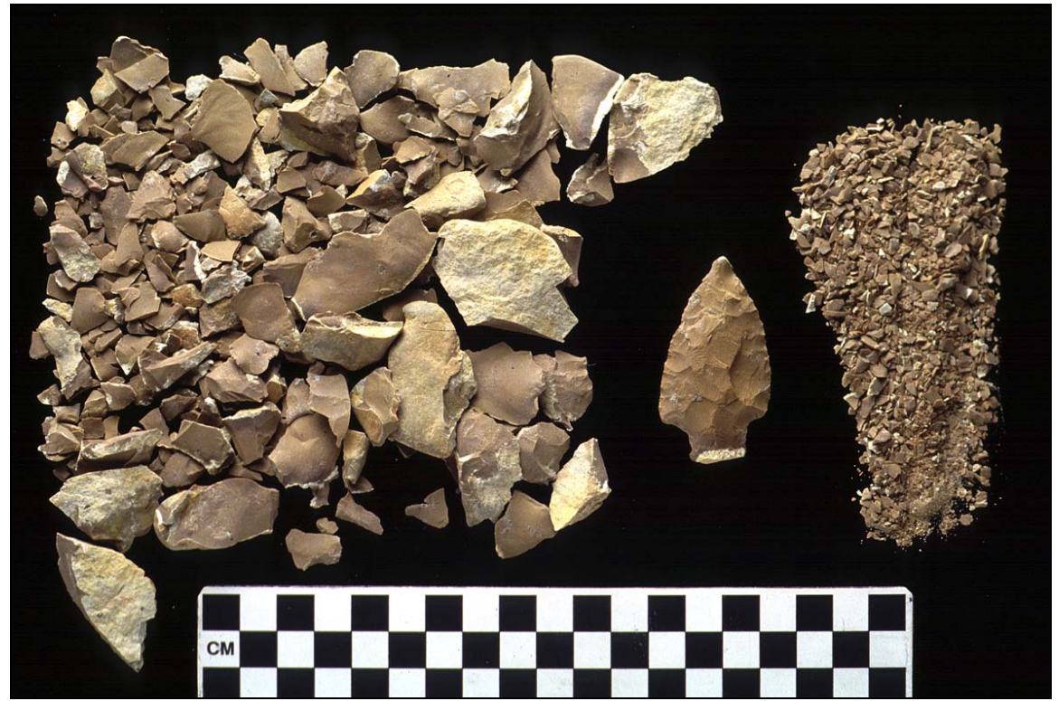
PLATE 11: Experimentally Produced Projectile Point and Associated Debitage

In an attempt to determine the functions for which the stone tools were used, the edges of a selected sample of tools from the Puncheon Run Site were examined under a microscope for evidence of use-wear or use-related edge damage. This functional analysis was integrated with the overall approach to the site, which was to study how different prehistoric living areas and activity areas were distributed across the landscape. Groups of tools were therefore chosen for analysis from the main excavation foci, to determine if significant differences existed between the different areas in terms of stone tool use. The tools chosen for examination were first inspected with a hand lens, and those selected for microscopic analysis all appeared to have edge wear at this low magnification. Because different kinds of stone wear differently, to simplify the research it was focused on tools made of chert and jasper, the two materials most amenable to this type of analysis. Tools made of quartz, quartzite, and argillite were excluded. The microscope employed had a range of 5 to 400 power; most of the edges were inspected in the 16 to 100x range. A detailed account of this analysis is given in Volume II, Appendix G.