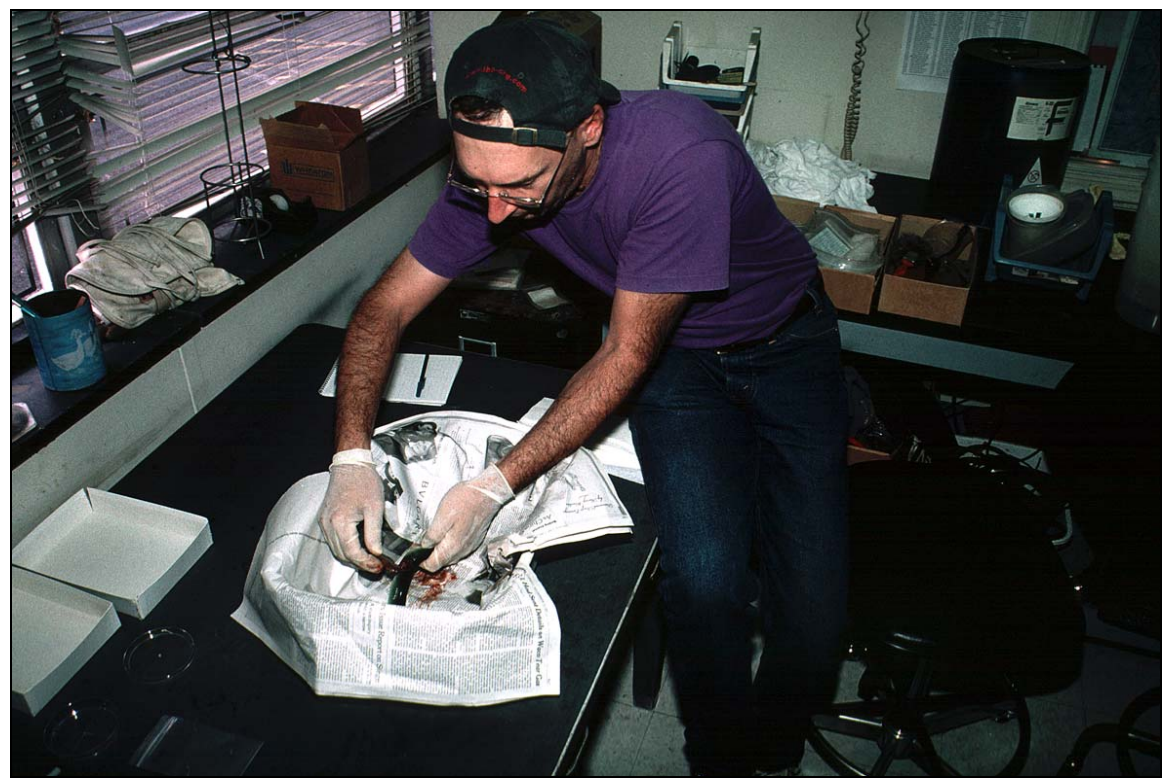
PLATE 9: Experimental Butchering of Eel with Stone Tool. Butchering of locally available fish was undertaken in association with protein residue studies.

species, as well as several commercially available terrestrial and aquatic species. Strongly positive results were obtained from two of the locally caught fish species, gizzard shad ( Dorosoma cepedianum ) and American eel ( Anguilla rostrata ). The same technique has been employed at Puncheon Run (Plate 9). Protein antisera were developed from 11 native fish species, selected to represent a range of environments and strategies of exploitation, and tools from selected areas of the site were tested against these antisera, as well as commercially available antisera for several terrestrial species. A more detailed description of the methods used, and the results, are presented in Volume II, Appendices I and J.