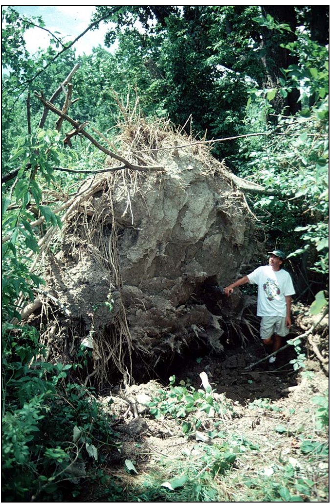
excavations at Puncheon Run, a storm uprooted a large tree near Locus 1. Crew Chief Jim Skocik examines the root ball.

For this reason, Berger planned its extended Phase II testing in large part to investigate the pit features. The plowzone was stripped from twenty 5x20-meter blocks, distributed across the site in areas of high, moderate, and low artifact density, to search for pit features. Before stripping, a five percent sample of each block was dug by hand and screened. A protocol for feature testing was developed to determine, if possible, whether any pit features that might be encountered were cultural in origin, or whether they were instead of natural origin. This protocol included cross trenching through the features and extensive sampling of feature and nonfeature contexts for soil chemistry, micromorphology, and other analyses. In parts of Locus 3, a thick E-horizon was present beneath the plowzone. HRI's research at Puncheon Run and Hickory Bluff (across the river) had shown that feature fills are often very similar to the E-horizon and that features can be very difficult to detect where E-horizons are present. Therefore, three techniques for locating features beneath the horizon were tried: systematic sampling with a split spoon, systematic measurement of soil compaction, and, in one block, use of the backhoe to remove the E- PLATE 10: Uprooted Tree Near Locus 1. During horizon.