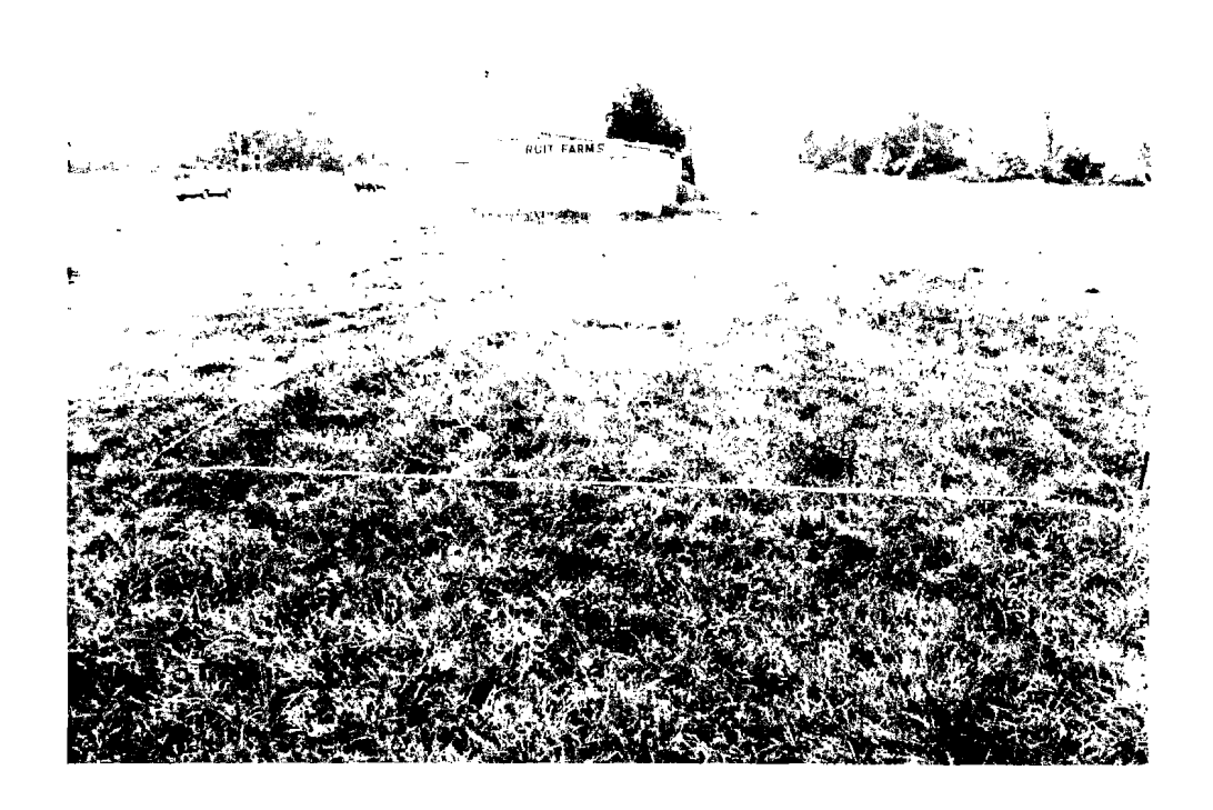
Plate 12.2. Area C, view facing south showing the Richter House Site 2; the footprint of the house, erected in the mid-20th century, is outlined with flagging tape (August 1994) [HRI Neg. 94015/1-21].