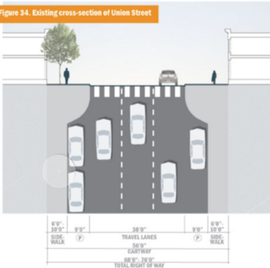
Figure 34. Existing cross-section of Union Street