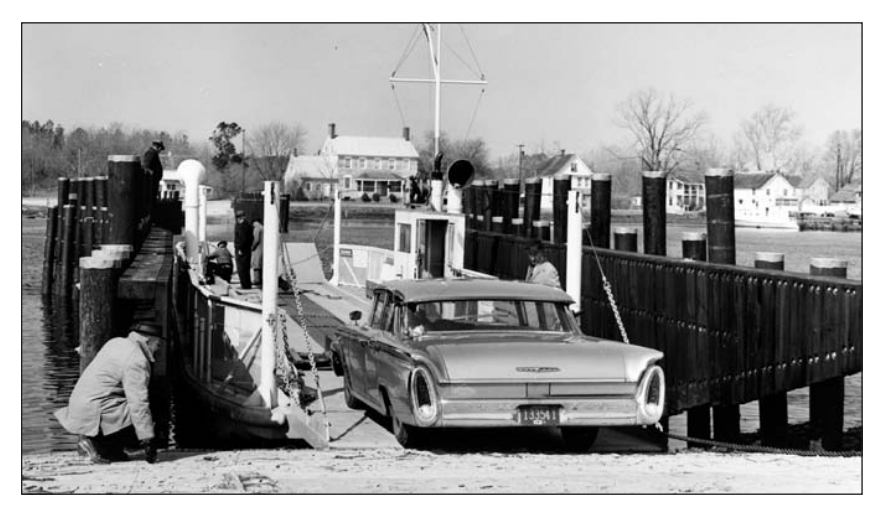
Testing the newly completed "Virginia C" ferry boat in March 1961.