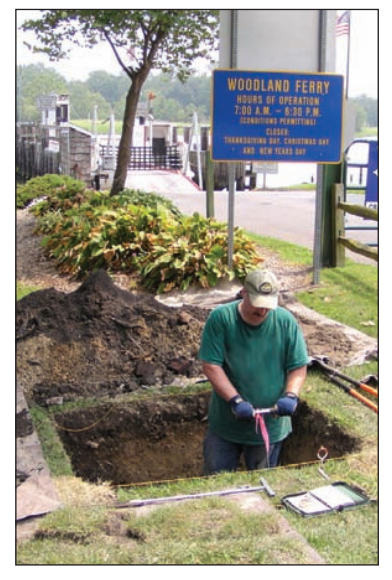
Archaeological testing in progress at the right bank ferry slip in August 2007.