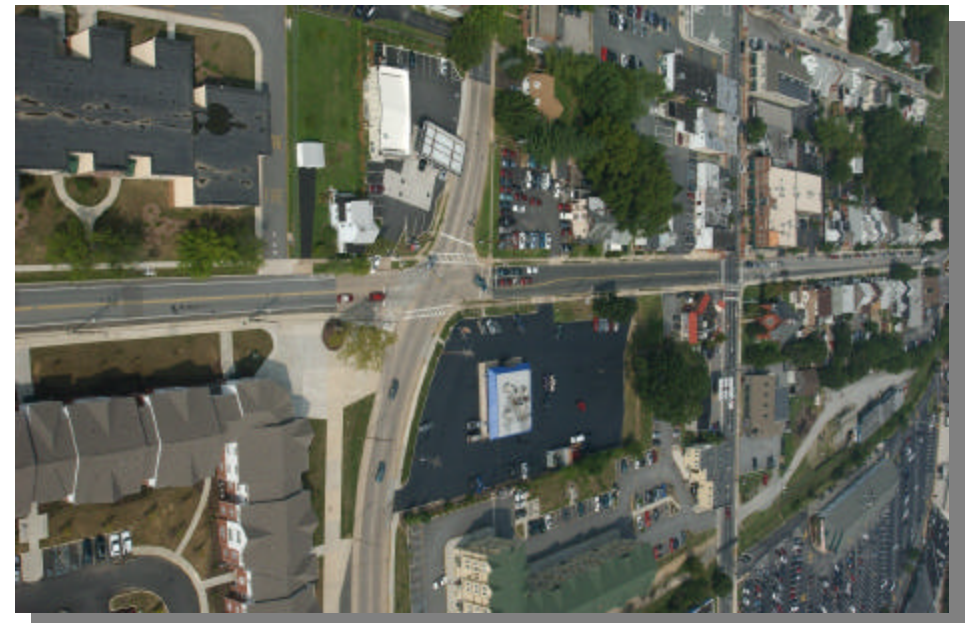
Proposed Site for Newark Transit Hub