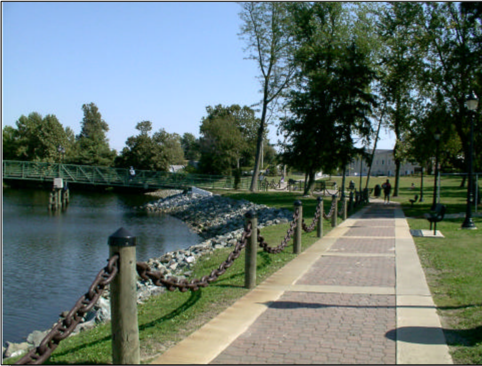
Mispyllion Greenway, Milford