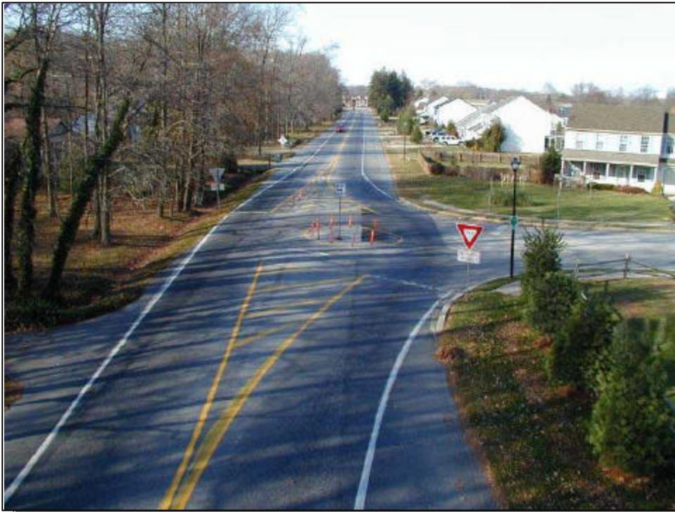
Previous Temporary Traffic Roundabout at Mifflin Road, Dover