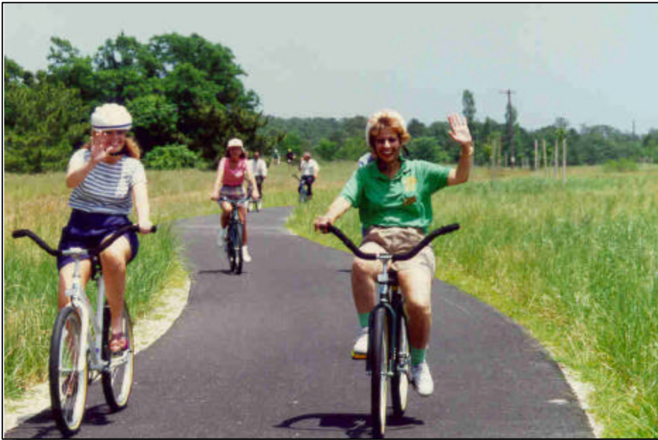
Cape Henlopen State Park Bicycle Improvements