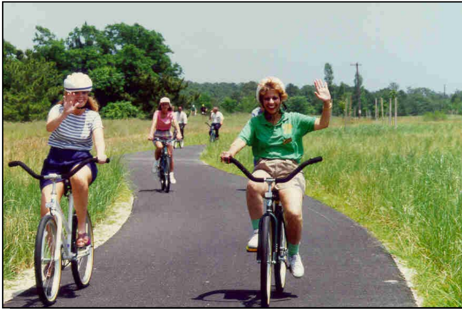
Cape Henlopen State Park Bicycle Improvements