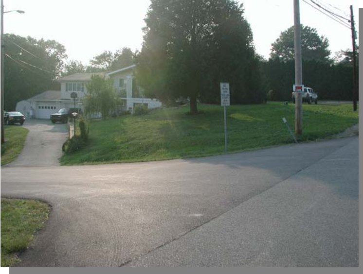
Church Road – Existing Conditions