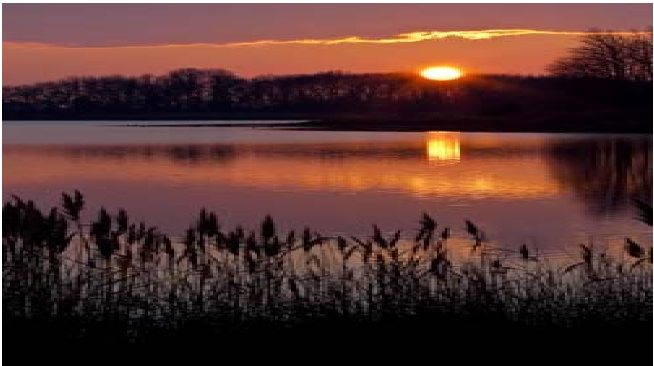
Bombay Hook National Wildlife Refuge, Smyrna, Delaware