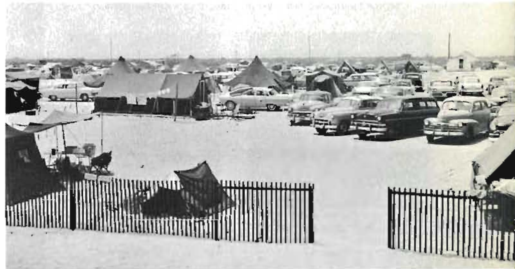
Busy camping area at Key Box Road along the Atlantic.

One major problem still faces the Department . . . the lack of drinking water. It still has to be solved, though the need for sanitary and policing arrangements have reached an acceptable stage for the time being.