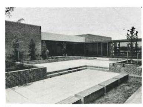
The courtyard between buildings.