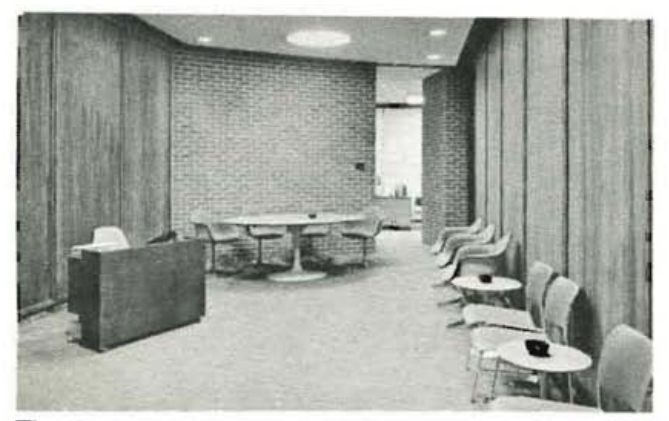
The Commission Room Reception Area.

HIGHWAY ADMINISTRATION CENTER FACILITIES