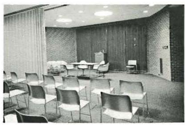
The first floor Assembly Room