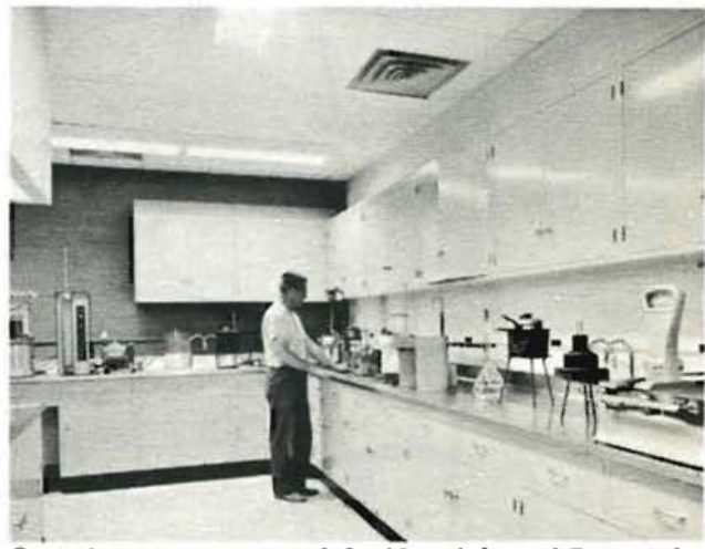
One of the work areas of the Materials and Research Laboratory.