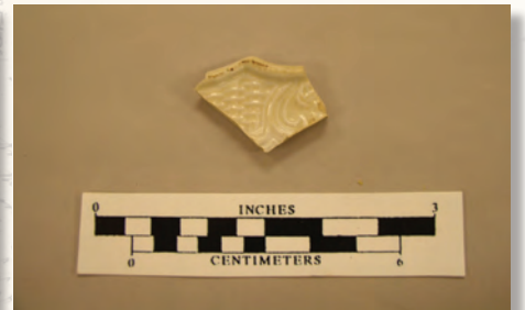
Figure 3. Some of the artifacts discovered previously at the site.

For more on the DelDOT Archaeology Program: