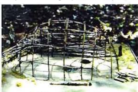
Reconstruction of a house structure, at the Iron Hill Museum

nly a few hundred feet north of Frederick Lodge, an ancient Native American group camped near another small "bay/basin" at the Black Diamond Site. Like their neighbors at Frederick Lodge, these people excavated pits and built fires, but their tools were manufactured from a unique kind of grey and red quartzite.