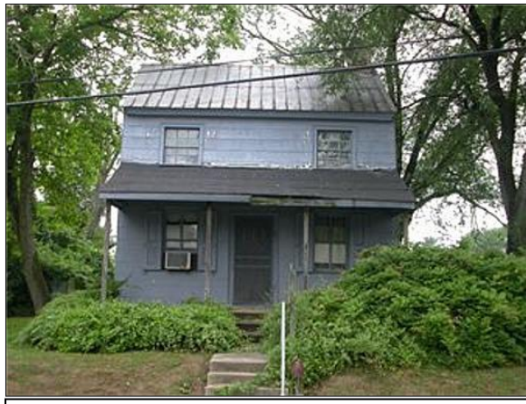
1. Dwelling, front elevation, looking west

Insert photographs; note file name and brief description of view: (size photograph 3" on longest side; MAINTAIN ASPECT RATIO - DO NOT STRETCH PHOTO)