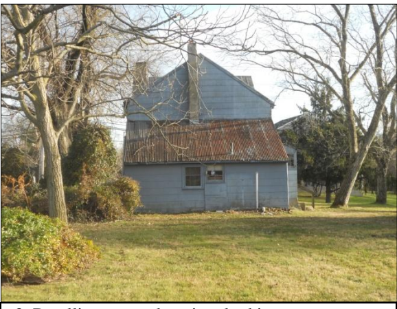
3. Dwelling, west elevation, looking east