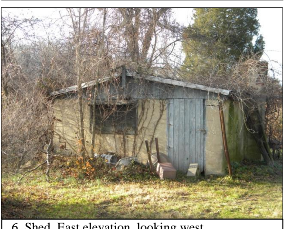
6. Shed, East elevation, looking west