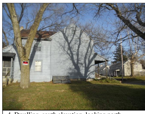
4. Dwelling, south elevation, looking north