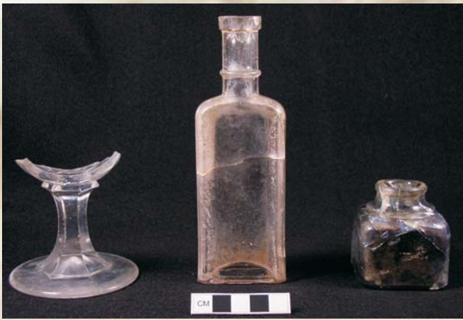
Mid to Late 19th Century Glassware