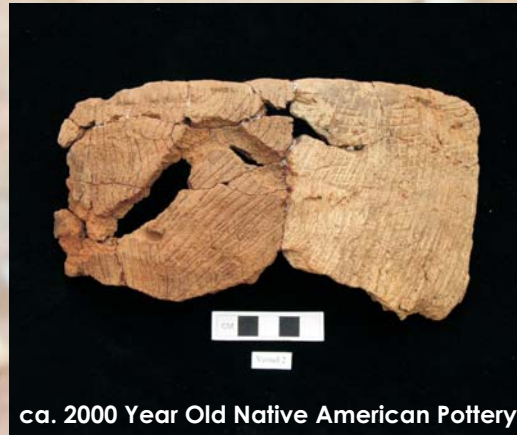
ca. 2000 Year Old Native American Pottery