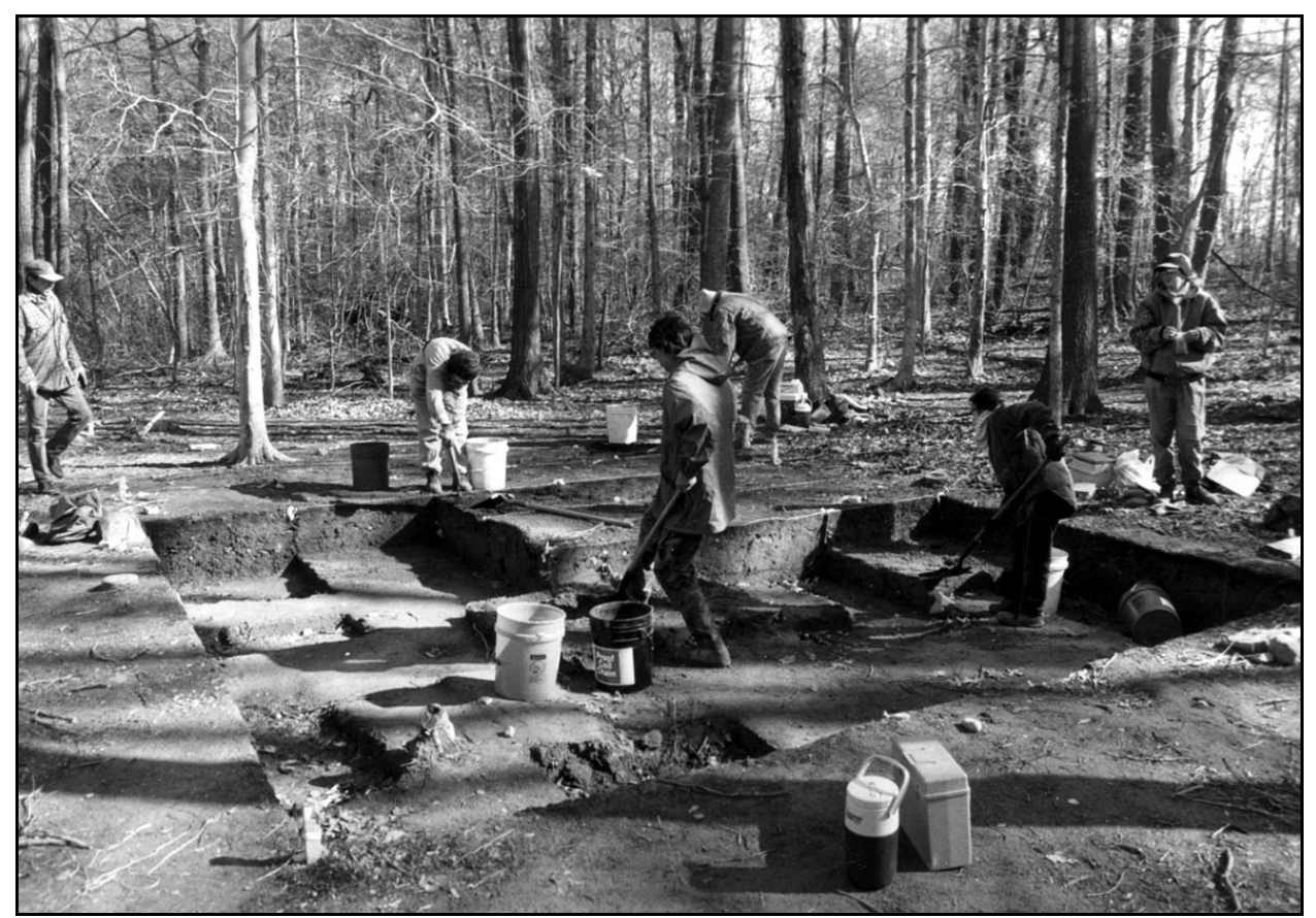
PLATE 2: West Block Excavation in Progress, View to Northeast, Site 7NC-G-151

Two-liter soil samples were collected in every excavated level from 25 percent of the measured excavation units and from all feature fill. Samples were collected from the southwestern corner of the excavation unit, providing a continuous column sample. These samples were processed for the recovery of archaeobotanical and faunal remains using the Dausman Flote-tech System, a water-separation flotation device (Plate 3). Upon separation of the light and heavy fractions (Plate 4), 40 processed samples were submitted for archaeobotanical analysis and identification.