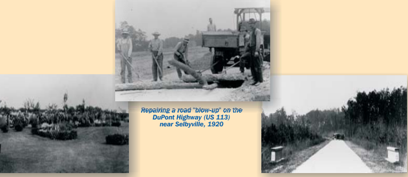
lower gardens at the inter DuPont Highway (US 113) and Georgetown to Laurel Road (US 9), ca. 1923