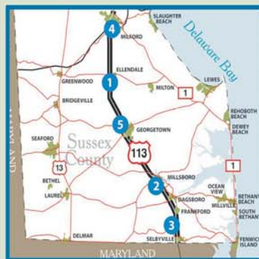
Si necesita un intérprete en español en los talleres de Milford o Millsboro, llame por favor a DeIDOT por adelantado.

Although similar information will be available at each workshop, information specific to each area will be available as well. If you have special needs or require aid, such as an interpreter, please contact DeIDOT by phone or mail a week in advance.