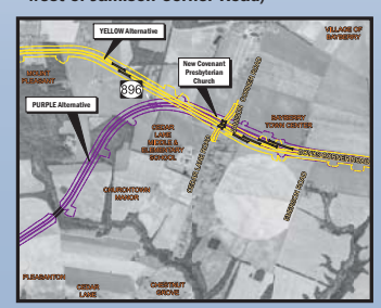
WENDOW and BURBUE-SBUR