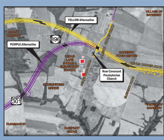
YELLOW and PURPLE+SPUR

Shifts New US 301 alignment to 230 feet north of New Covenant Presbyterian Church. Impacts southwest corner of proposed Town Center (Bayberry)