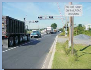
1 Westbound Boys Corner Road at US 301