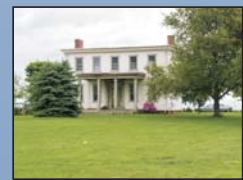
B.F. Hanson House (#N05225)