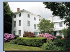
S. Holton Farm (#N00107)