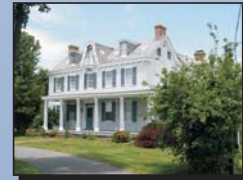
The Maples (#N00106)