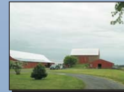
Cochran Grange (#N00117)