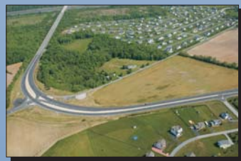
3 South of Summit Bridge Curve