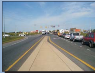
2 US 301 Northbound at SR 299