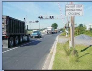
1 Westbound Boys Corner Road at US 301