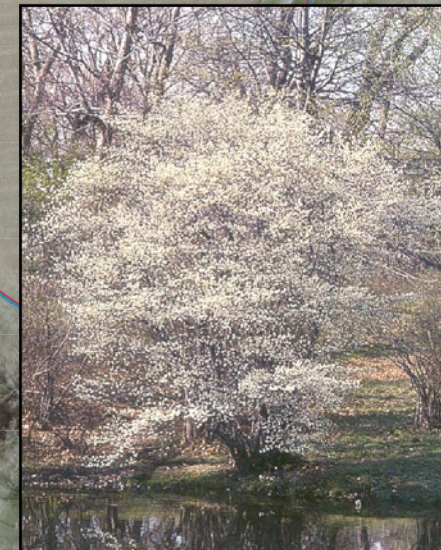
Shadblow Serviceberry - to 25' tall