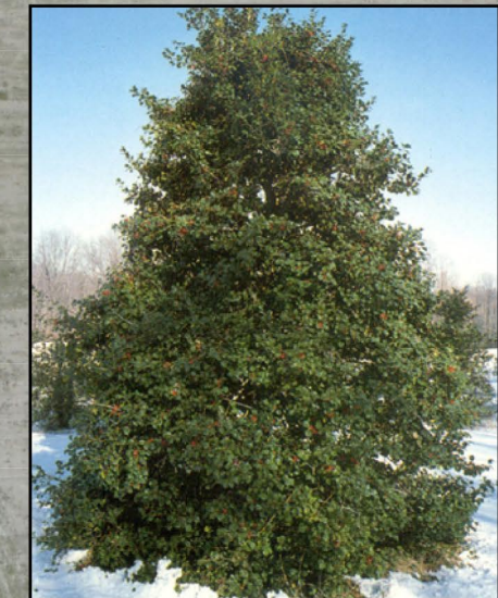
American Holly - to 50' tall