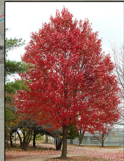
Red Sunset Maple - to 100' tall