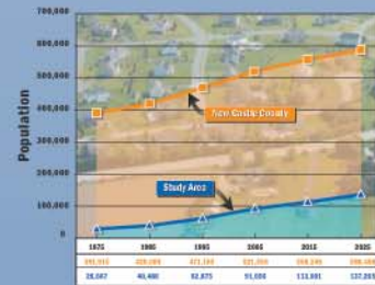
Population Trends New Castle County & Study Area

Study Area population increased nearly 219% from 1975 to 2005 and is projected to grow another 50% through 2025.