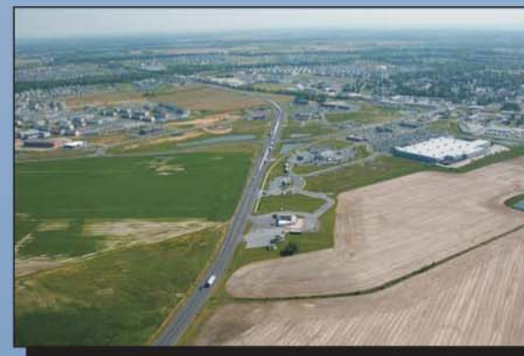
New Castle County

Study Area jobs increased nearly 80% from 1975 to 2005 but are projected to only grow another 6% through 2030.