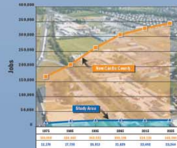
Employment New Castle County & Study Area

Study Area jobs increased nearly 80% from 1975 to 2005 but are projected to only grow another 6% through 2030.