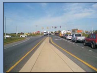
2 US 301 Northbound at SR 299