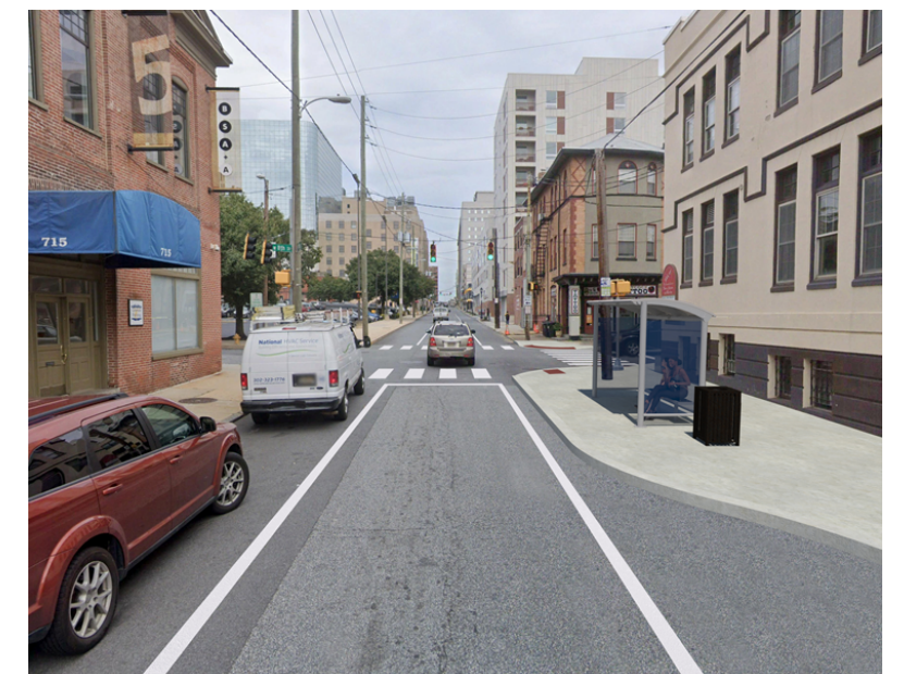
Orange Street between 7th and 8th Streets with proposed improvements

From 5th Street to 9th Street, parking on both sides of the road, with one travel lane.